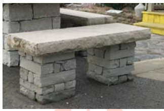
Planned Design for Garden Benches