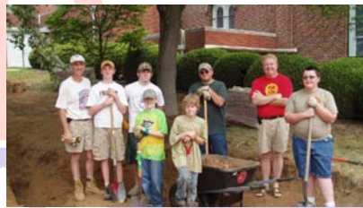
Troop 114 Scouts and Parents Working on The Prayer Garden