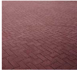
Concrete Pavers Donated by Alley-Cassetty