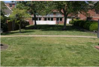
Prayer Garden Location Facing Church From West 7 th Street