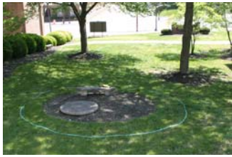
Prayer Garden Location Facing West 7 th Street